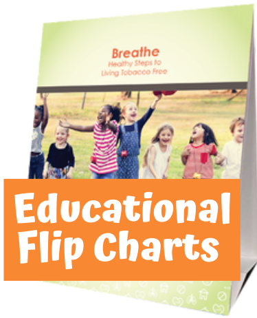
Educational Flip Charts