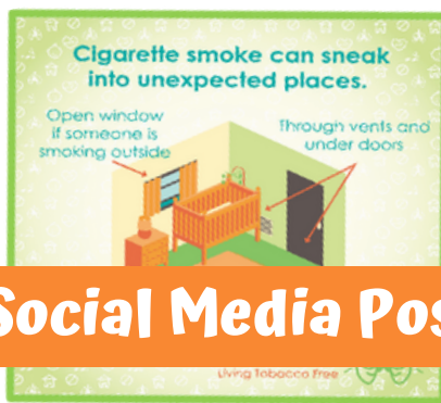
Social Media Posts