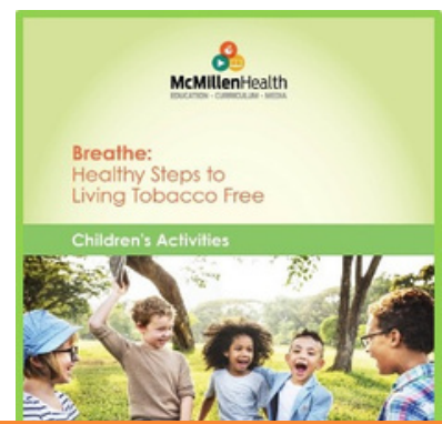
Parent & Children Activity Booklets